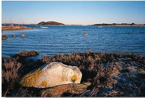
"Bay of Love", in the heart chakra of Samsøe Island